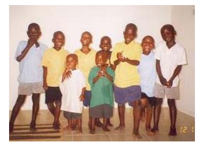
girls' clothes so they were all dressed in polo shirts and shorts temporarily. There are five girls and four boys ranging from 4 to 10 years old. They all settled in really quickly and love their new home and surroundings.

The children were cleaned up when they arrived and given new clothes. Unfortunately we had few