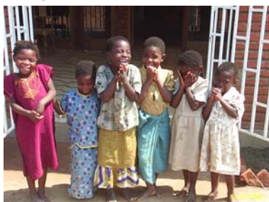
If you would like to help us towards the upkeep of the Centre or for future development of the project, please visit our website www. smilemalawi.com, or send a cheque to the address below.

Work is also continuing to help the local village of Ndokota and the charity has recently provided a new deep borehole for the people to use. The hand pump from their old shallow borehole was stolen leaving hundreds of families, including these lovely little girls, without water!